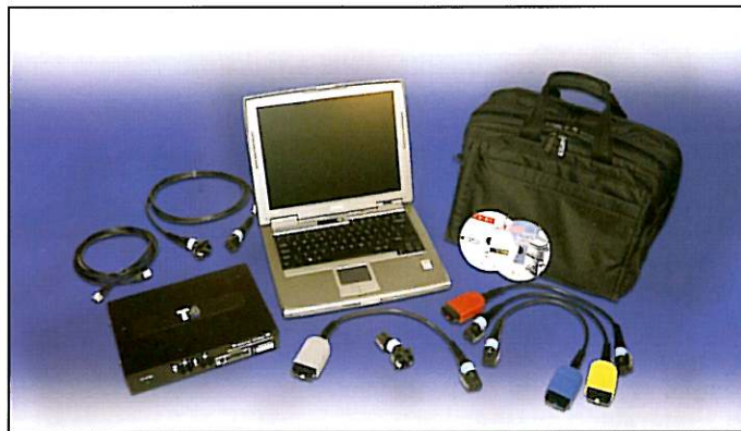
• The T4 Diagnostic Kit can be upgraded to connect to a wide range of vehicles

Building on its excellent knowledge of all OEM systems, Omitec provides a T4 upgrade kit giving AutoService centres the capability to expand into all-makes servicing. The hand held unit can be used standalone or via the Techcenter software which can be installed on users' existing T4 laptop, and allows users to connect to a wide range of vehicles from more than 25 manufacturers including Ford, Vauxhall and Volkswagen. Some of the systems covered in its 950 page application list include engine management, ABS, airbag, climate control and automatic gearbox.